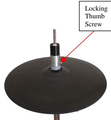
Locking Thumb Screw

The Cymbal and Roland clutch should now look something like this.